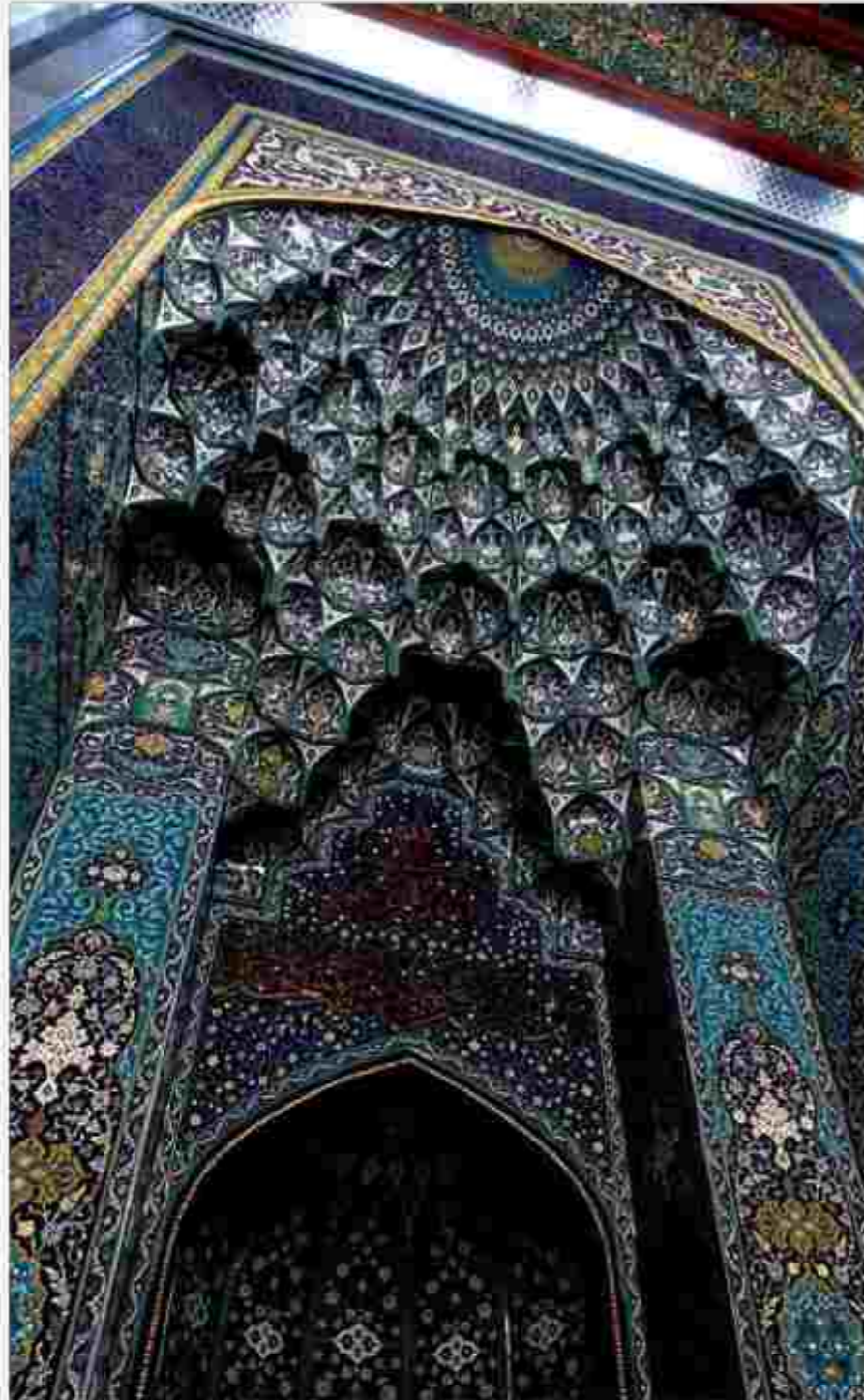
Sultan Qaboon Grand Mosque